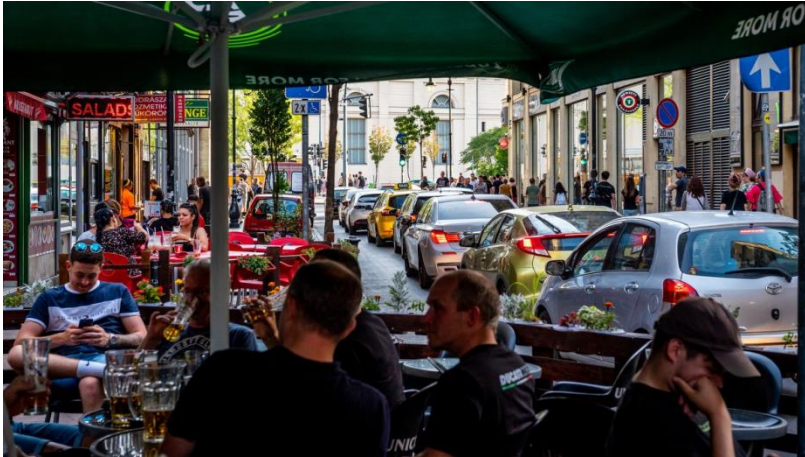
Figure 1 Use case 1 as is situation: Király utca before the pilot interventions

Budapest team scope is restricted to the Király utca between Rumbach Sebestyén utca and Károly körút . (Figure 1) Nowadays, this street is overcrowded because of the transit of vehicle traffic.