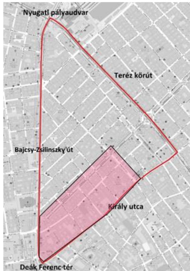
Figure 3. Use case 2: Area affected with new Mobility Points int the 6th district

Budapest team aim is to show the behaviour change – based on service provider’s data - of the users before and after the installation.