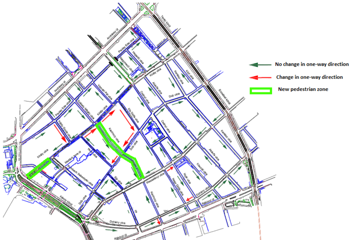
Figure 2. Use case 1: Planned interventions in the southern part of the pilot area.

traveling. So, when pilot changes made there will be a lot of new shorter routes for bikers and micromobility users.